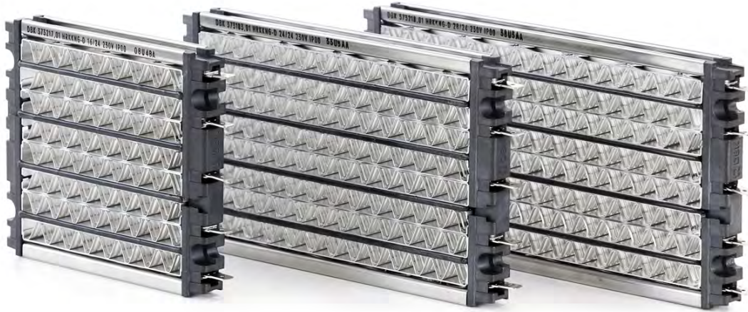
HRKK-D 16/24 (S)